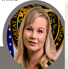
Terra Shows Class 28

"I thought I knew a lot about Muskogee, but Leadership Muskogee took it to a whole new level. I have made connections that will last a lifetime, while learning so much about our great city."